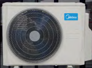
4.1kW & 5.3kW