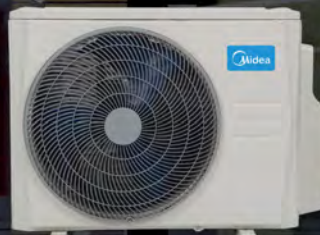
6.15kW & 7.9kW