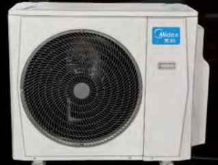
8.2kW, 10.6 kW & 12.3 kW